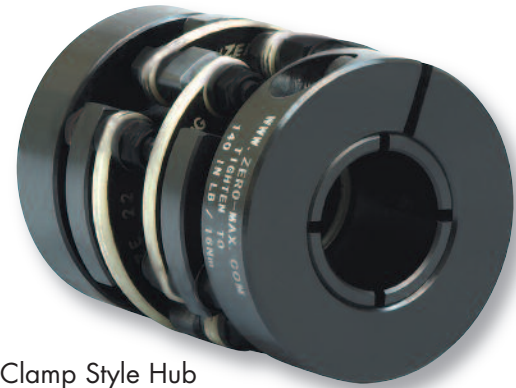
Clamp Style Hub

Available with or without keyway on clamp style hubs.